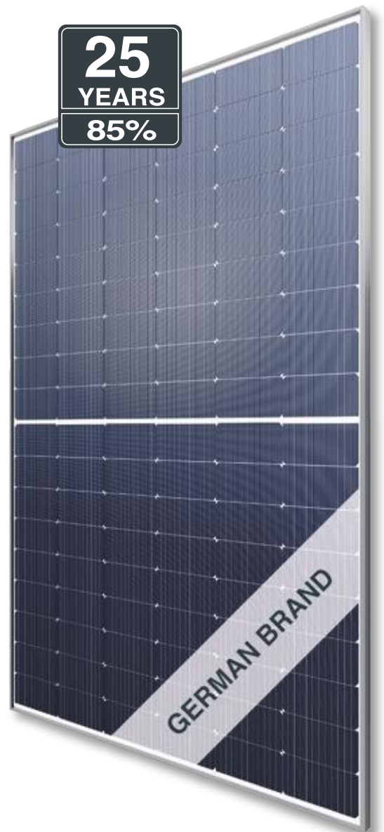
Fig. similar 108MHEN210225A

Exclusive linear AXITEC high performance guarantee!